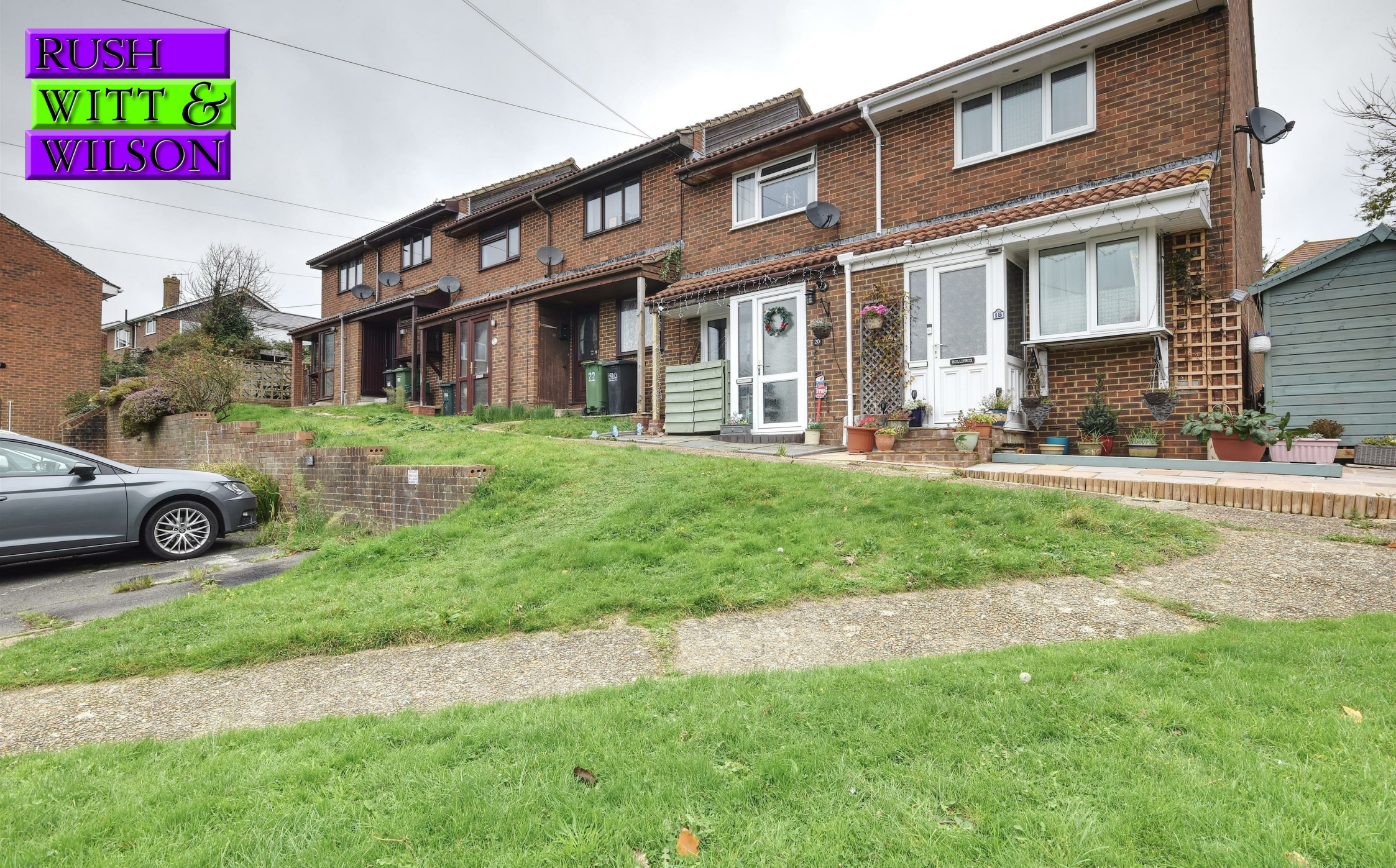
20 Mistley Close, Bexhill-On-Sea, East Sussex TN40 2TD £249,000